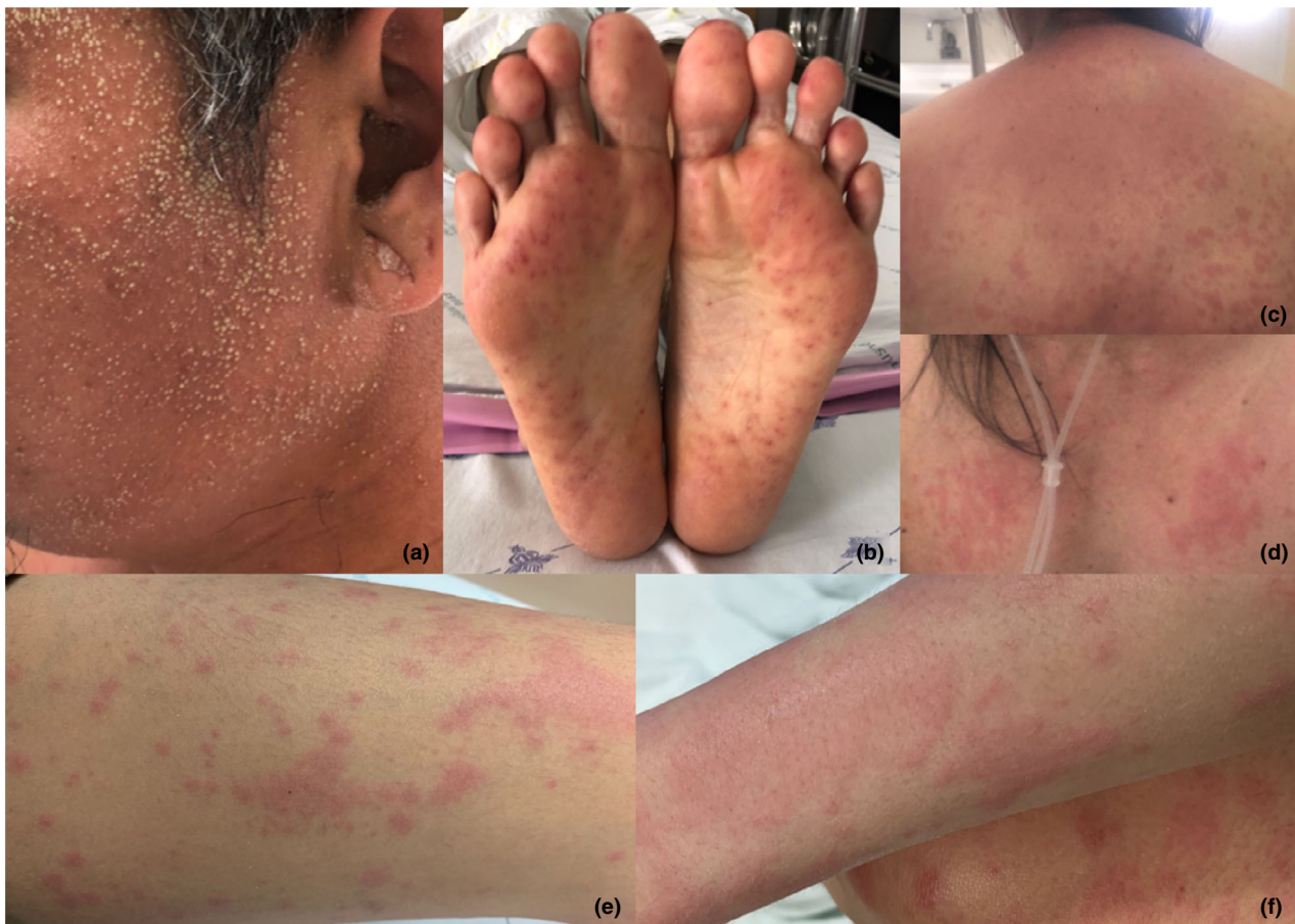
Figure 1. Clinical pictures of skin rash of cases 1–4. (a) Non-follicular minute pustules of case 1. (b) Purpuric macules on both feet of case 2. (c) Maculopapular rash on back of case 3. (d) Maculopapular rash on chest wall of case 3. (e) Non-blanchable red papules and plaques on leg of case 4. (f) Partially blanchable red plaques on forearm of case 4.

Immunohistochemistry (IHC) was done but failed to demonstrate significant deposition of immunoglobulin (Ig)G, IgM and IgA around the vessel wall when compared with a control. At that time, drug allergy could not be excluded. Therefore, the possible offending agents, including CQ and LPV/r, were discontinued and she was treated with a topical corticosteroid. The rash resolved with PIH 3 days after discontinuation of the medications.